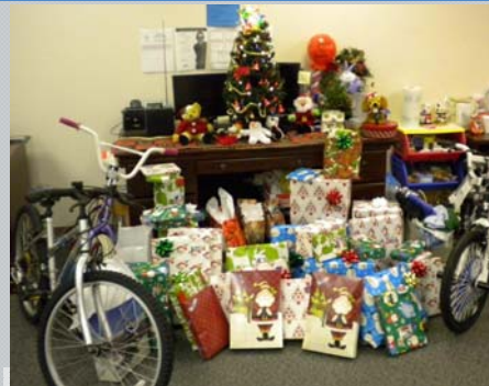
Holiday gifts donated by the staff at Career Central's Spring Hill location.

During the month of December, Career Central staff showed how much they care for the people in the communities we serve.